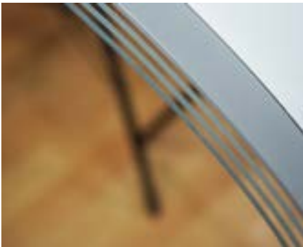
SELIN 70x70 cm