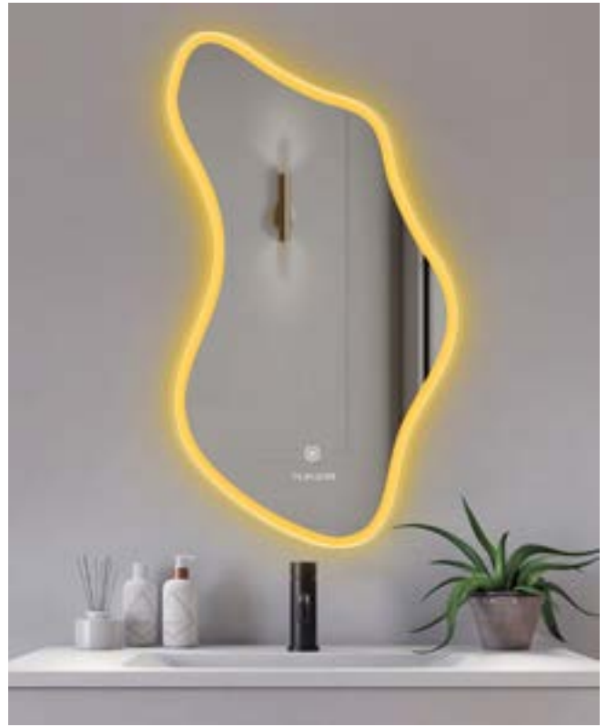
ARSHIDA 90 x 50 cm