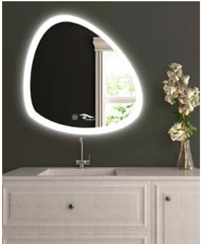
GERDSA 60 x 60 cm