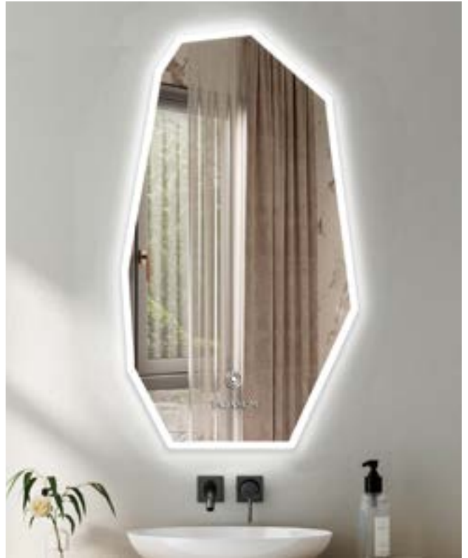
SANIL 90 x 50 cm