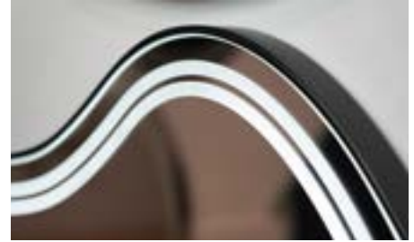
DIANA 70x70 cm