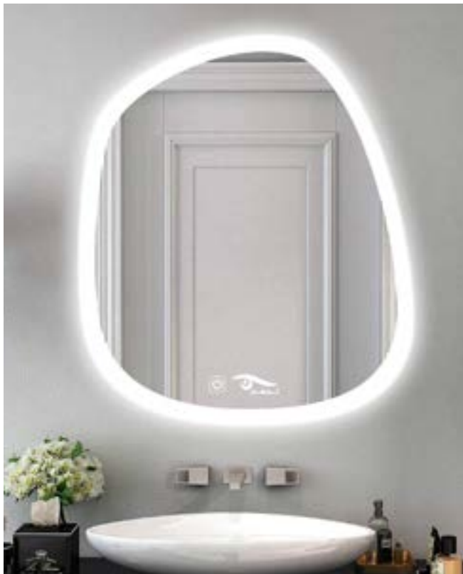
AVA 60 x 69 cm