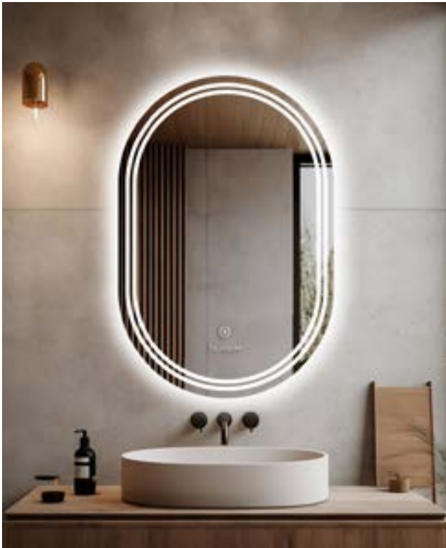
AMITIS 90 x 60 cm