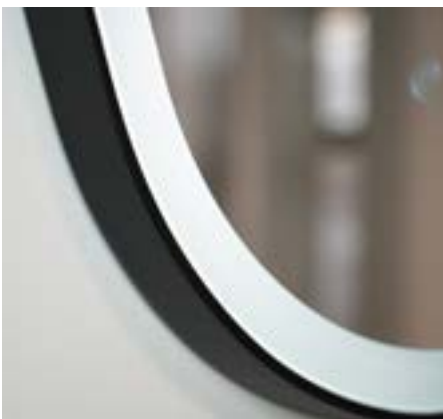
TIARA 90x60 cm