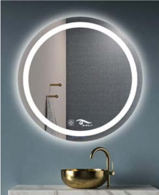
GERD 70 x 70 cm