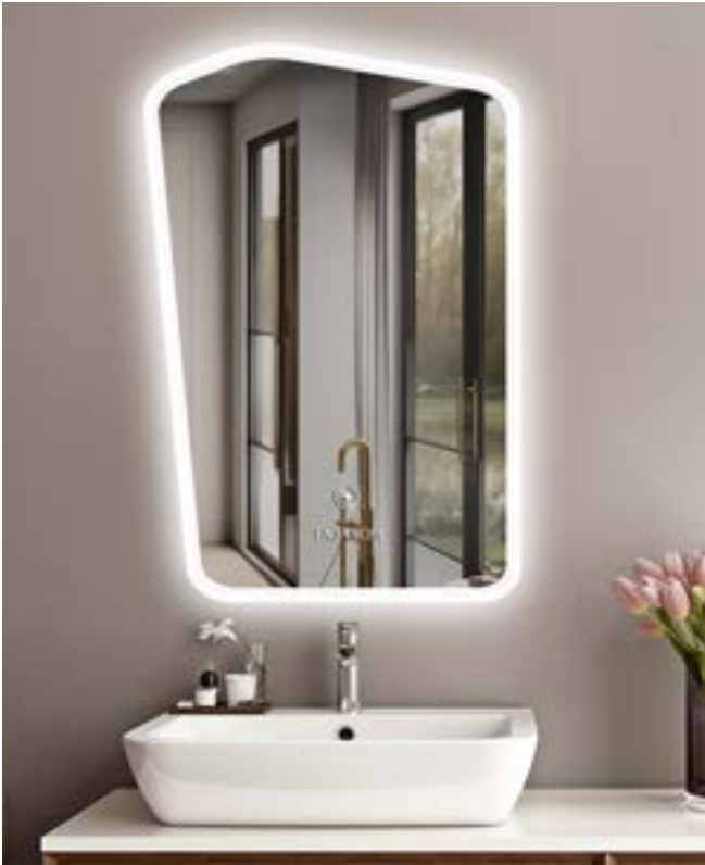
ABTIN 90 x 60 cm