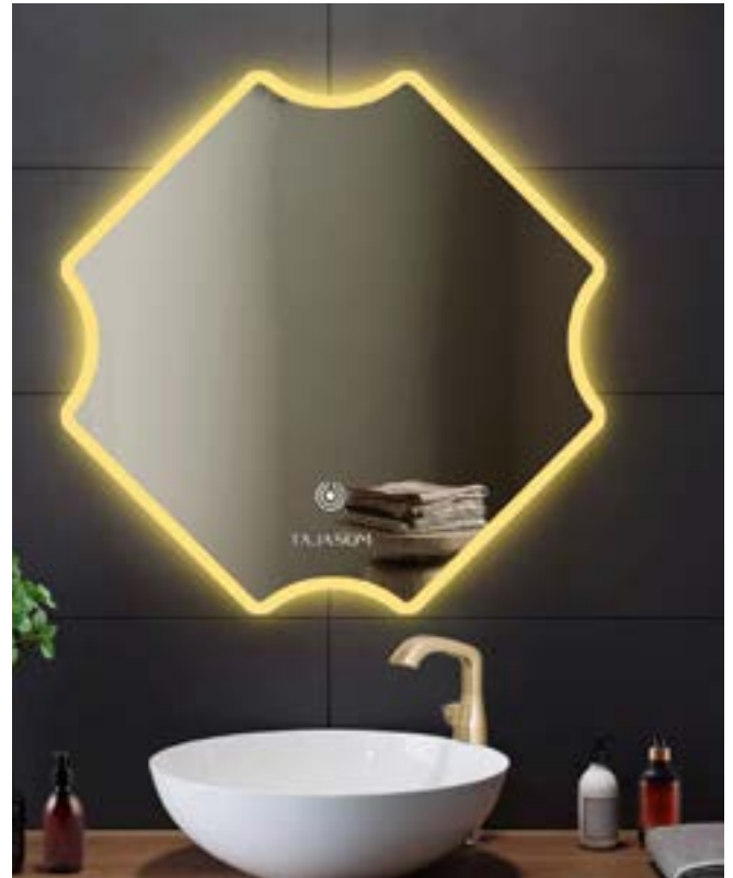
GOLSHID 70 x 70 cm