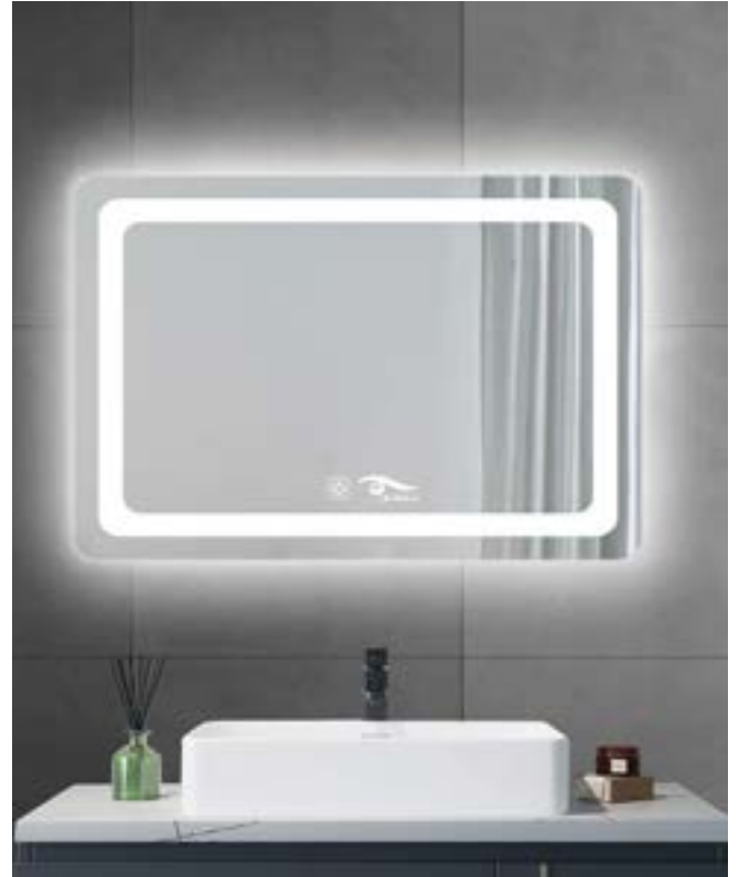
MOSTATIL 70 x 50 cm