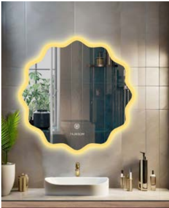
ANAHD 70 x 70 cm