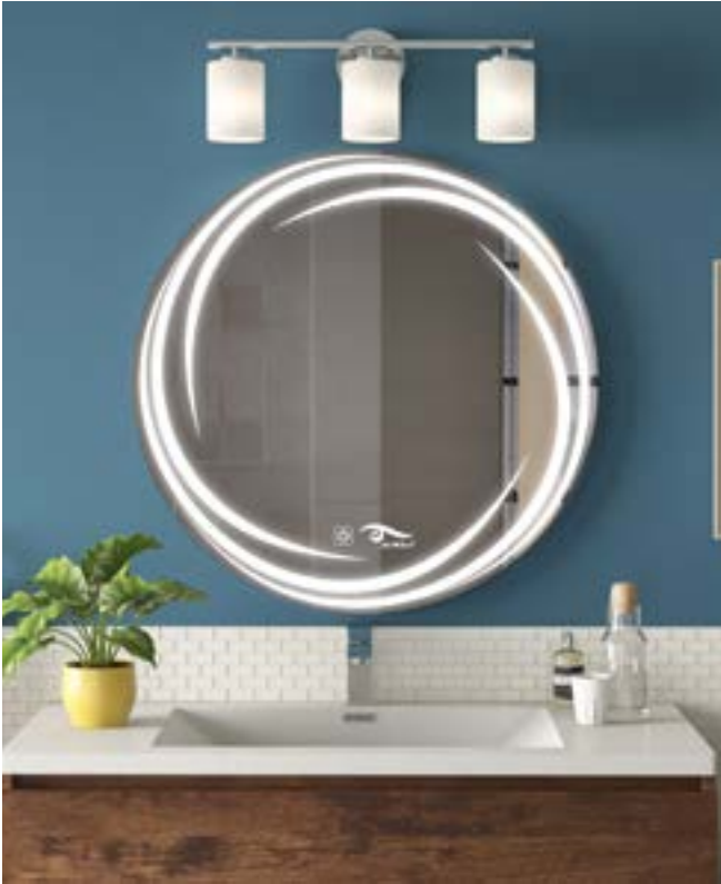
RAHA 60 x 60 cm