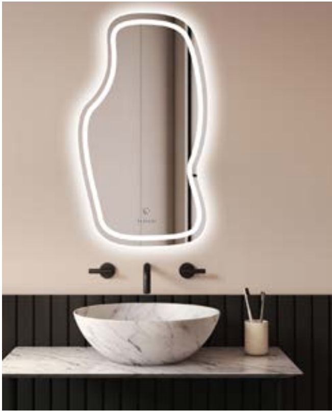
PARMIS 90 x 50 cm