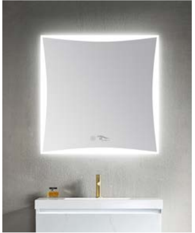
DALAN 60 x 60 cm