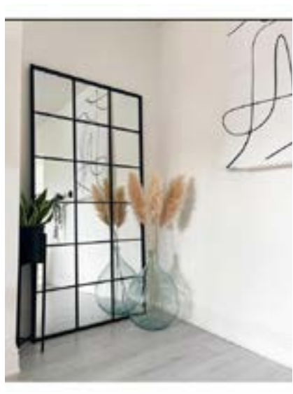
LIDA 180 x 80 cm