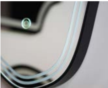
ANDIA 90x50 cm