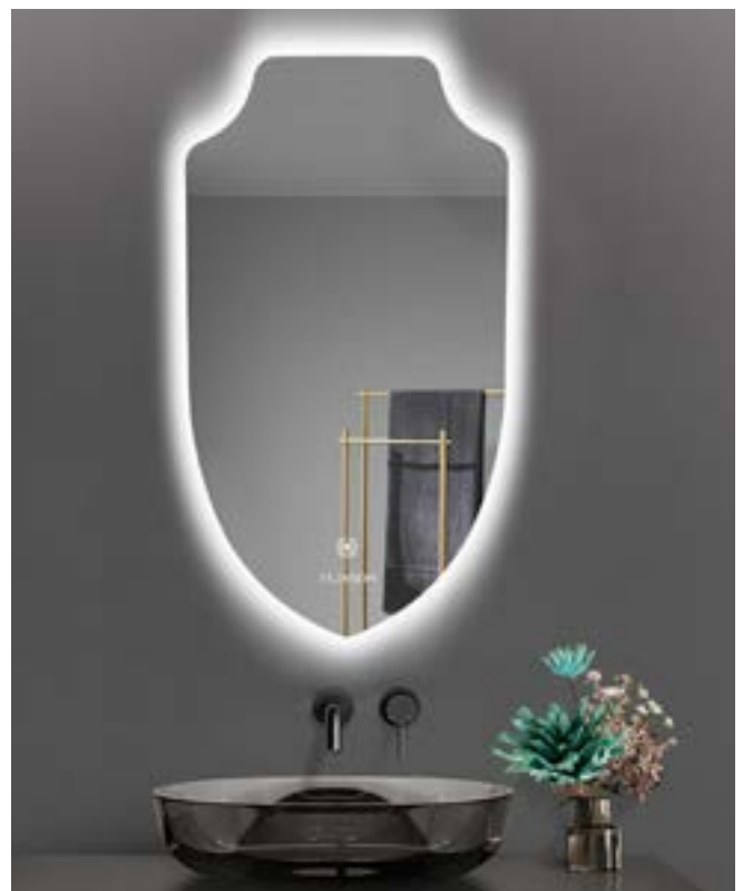
KIAN 90 x 50 cm