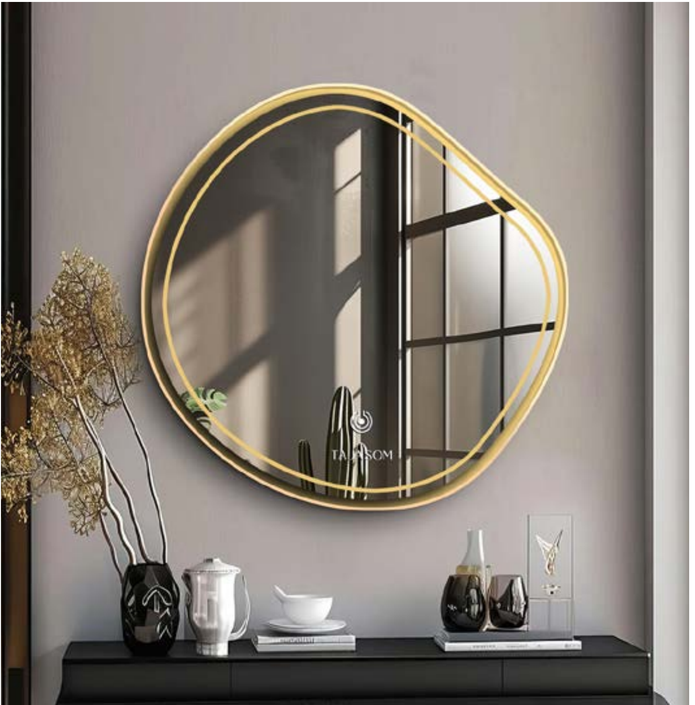
ANASHID 70x70 cm