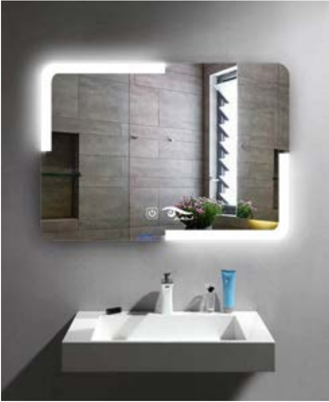
BRACKET 70 x 50 cm