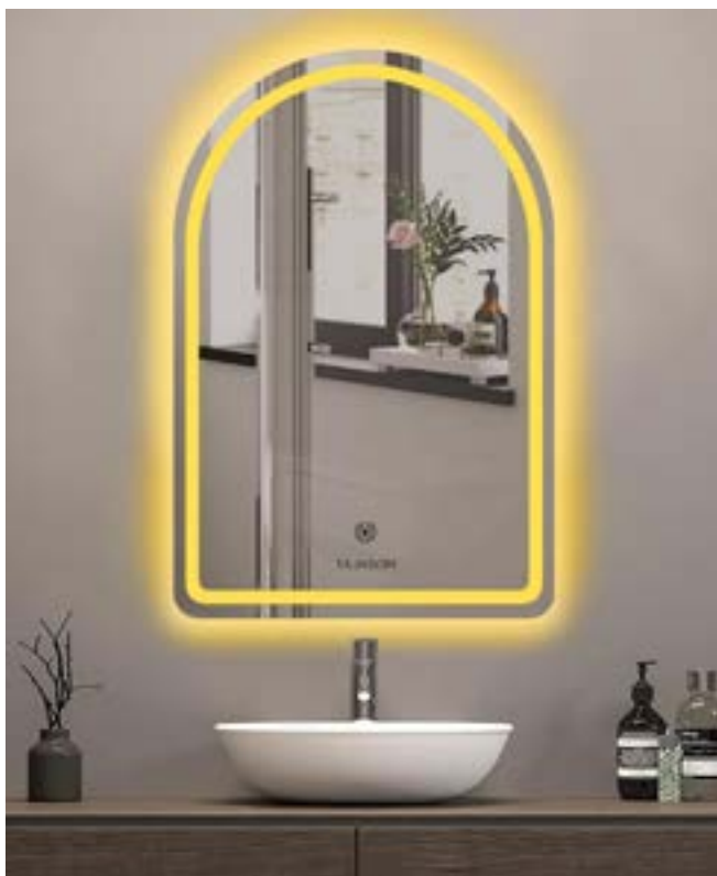
MAHDOKHT 90 x 60 cm