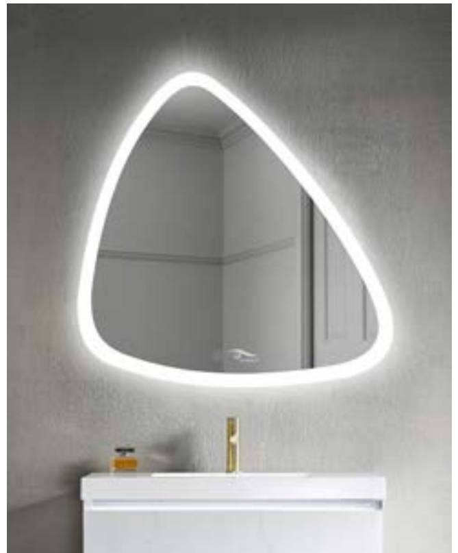
SEGOSH 70 x 70 cm