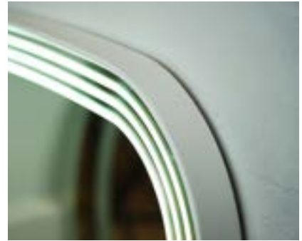
DIBA 70x70 cm