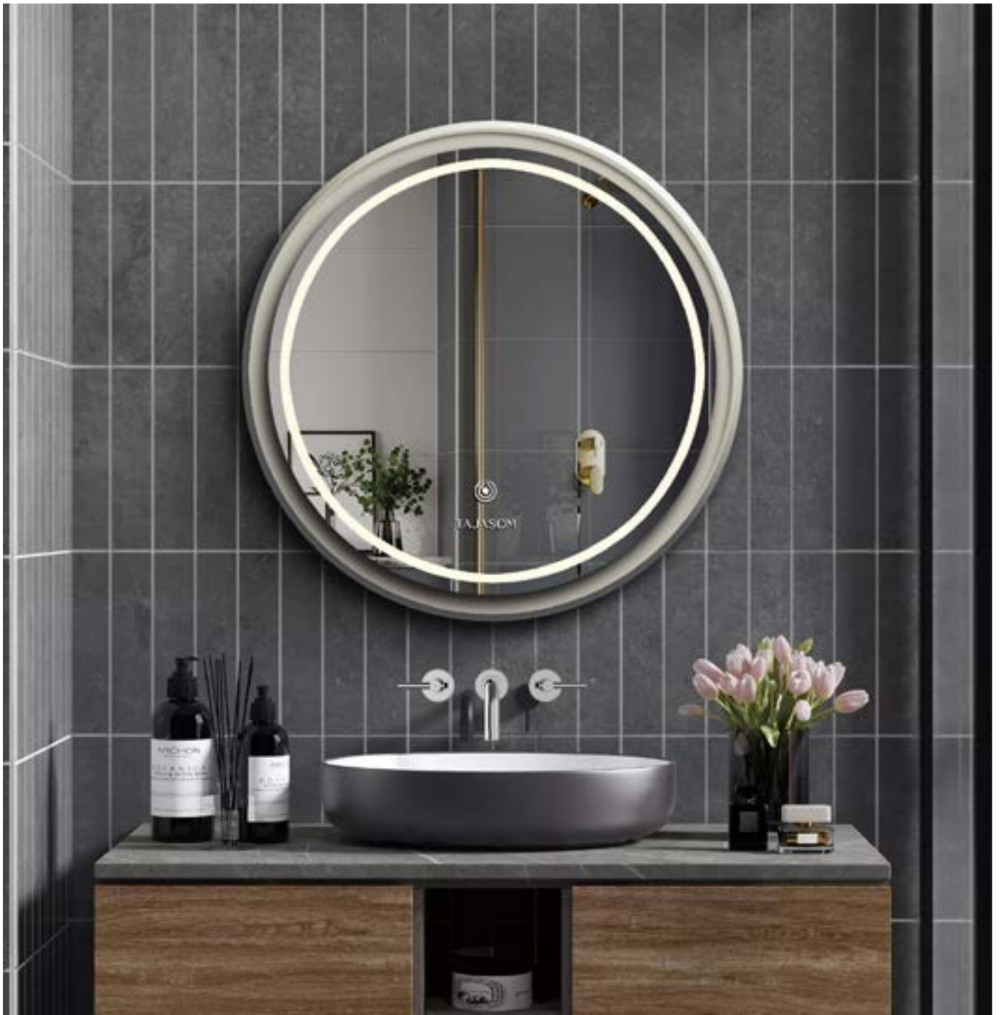
FARIMAH 70x70 cm