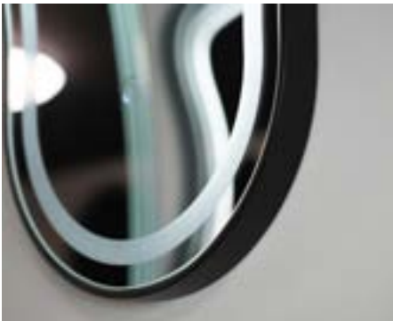
BARSAM 90x60 cm