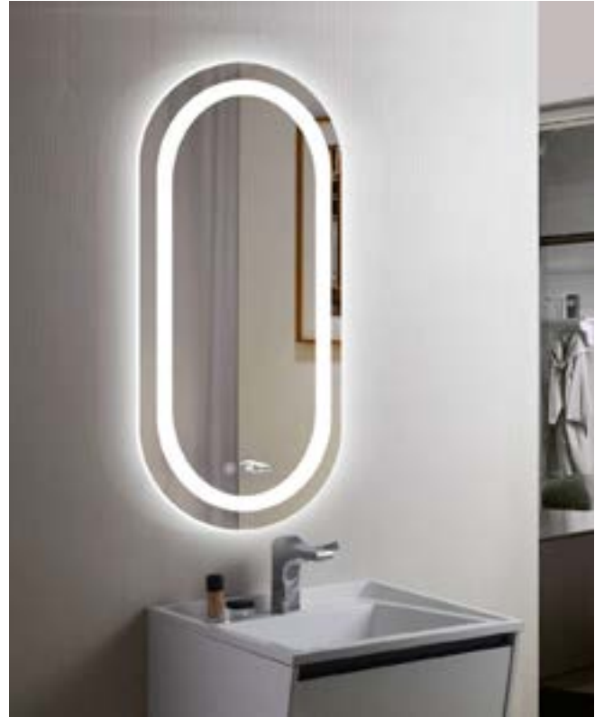
MOZON 90 x 40 cm