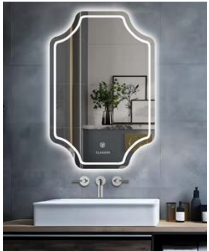
SHAHAN 90 x 60 cm