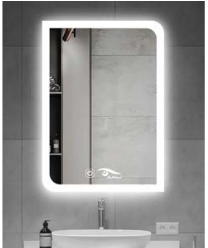
2R 70x 50 cm