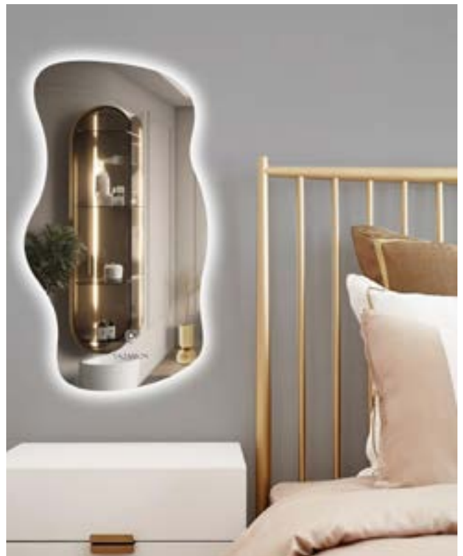
DARYA 90 x 50 cm