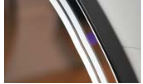
ELINA 90x50 cm