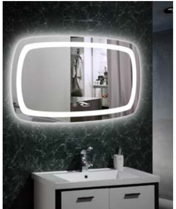
MOSTATIL R 90 x 50 cm