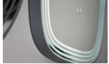
AYLIN 90x50 cm