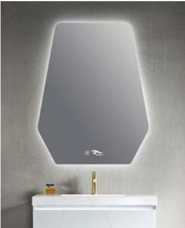
ALMAS 55 x 70 cm