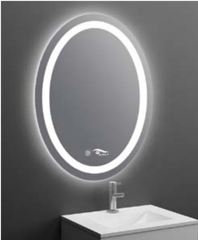
BEZIY 70 x 50 cm