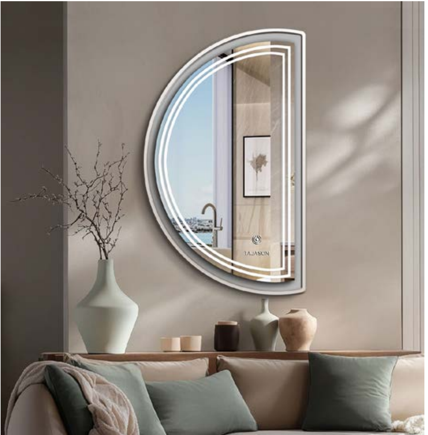
MAHLIN 80x50 cm