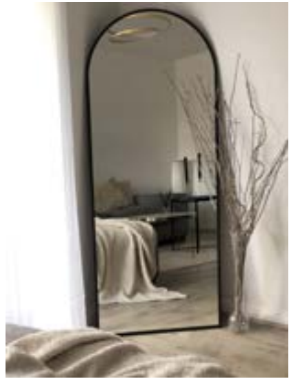
DAYAN 180 x 80 cm