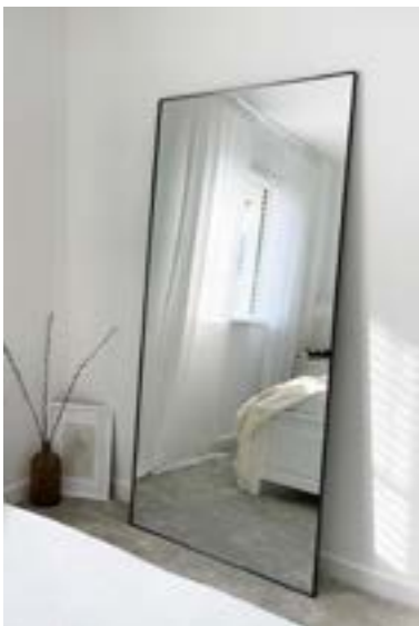
LOTOS 180 x 80 cm