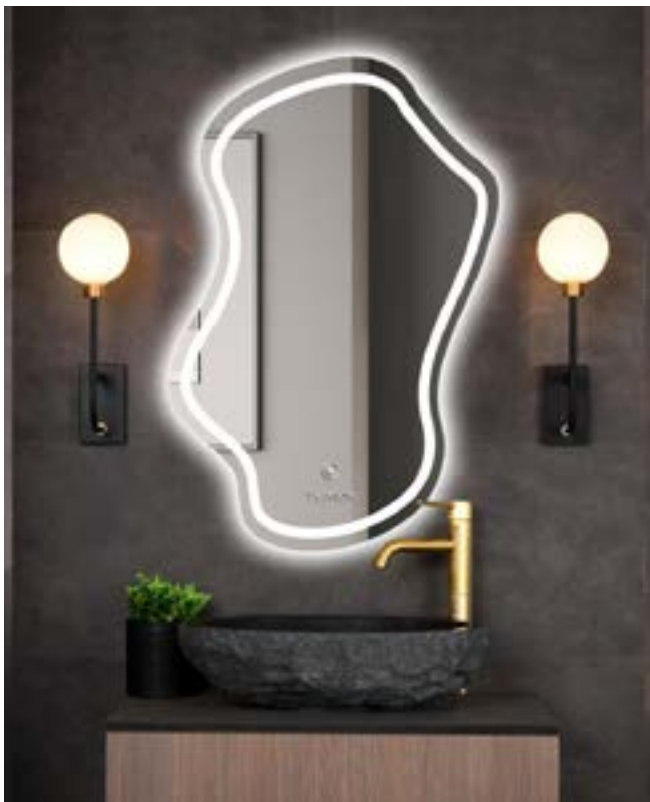
BERKE 90 x 60 cm