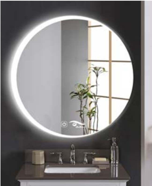
MAH 60 x 60 cm