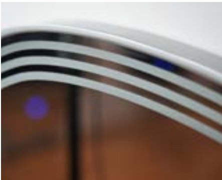
ZHAKLIN 70x70 cm