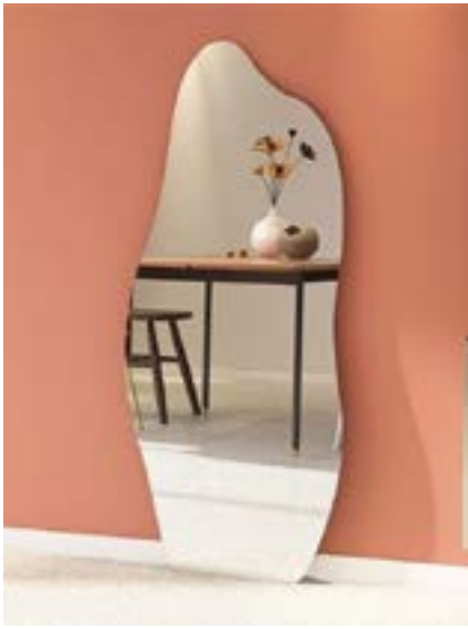
SETARE 180 x 80 cm