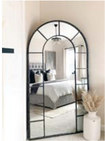
ARGHAVAN 180 x 80 cm