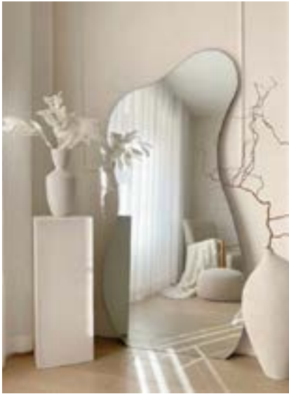
GISOO 180 x 80 cm